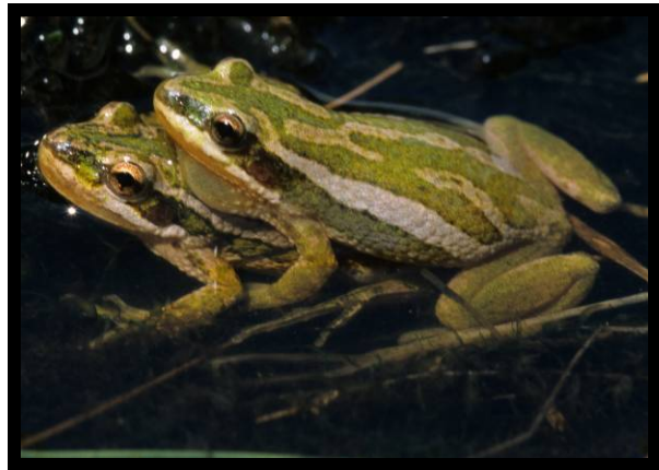
FIGURE 1. Two adult Boreal Chorus Frogs ( Pseudacris maculata ) found in amplexus in Baie Boatswain, Québec (station W21).

In Canada, P. maculata inhabits a variety of usually open, moist, and grassy habitats. It occurs in prairies, aspen parklands, boreal forest regions, and forest-tundra transition zones. It is found in shallow pool waters in