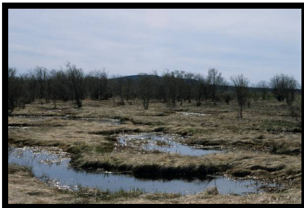
FIGURE 4. Representative thicket swamp breeding habitat of Pseudacris maculata in Baie Boatswain, Québec (station R20).

Together, P. maculata and A. americanus , L. sylvaticus , and/or P. crucifer breed in fish-free habitats. We captured five adult P. maculata during the day (Table 3) and observed one amplexing pair. Mean snout-vent and right tibiafibula lengths for these adults were 32.1 mm ± 3.4 (SD) and 11.7 mm ± 0.9, respectively. When positioned for photographic documentation, a female released 384 eggs, suggesting that resident gravid females at these sites were primed for egg deposition. However, we did not find egg masses or tadpoles in the field. We deposited the five